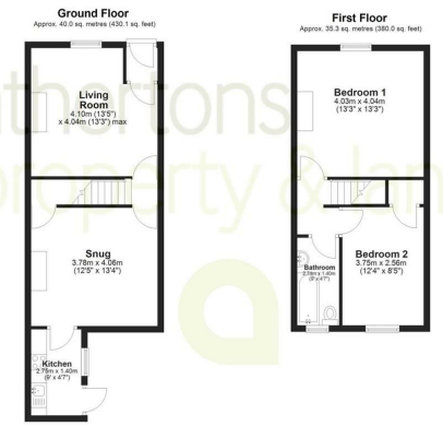
Total area: approx. 75.3 sq. metres (810.1 sq. feet) Provided for illustrative purposes only. Actual sizes and dimensions may vary from those shown. Plan produced using Planity.